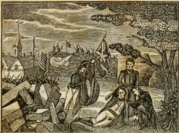
TAKING OF YORK, AND DEATH OF GENERAL PIKE.